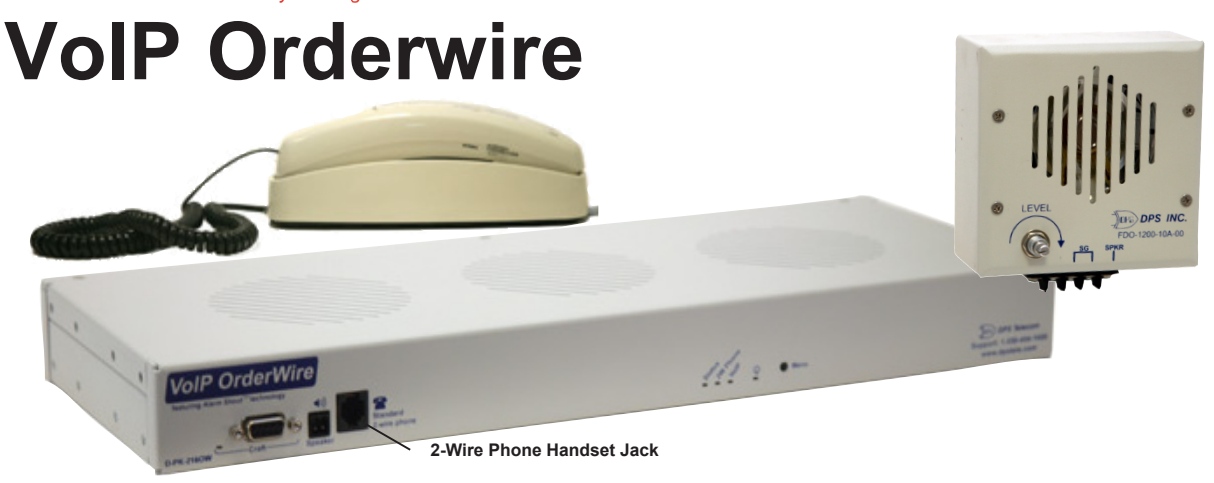
Deploy free voice communication at all your LAN sites across your network.

"Your Partners in Network Reliability Management"