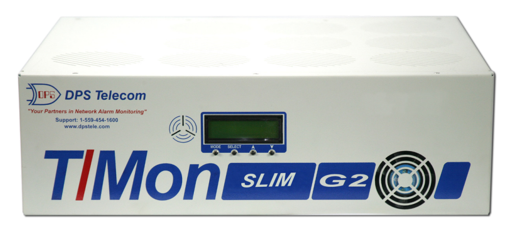
T/Mon SLIM gives network managers effective, real-time control and visibility of their alarms.