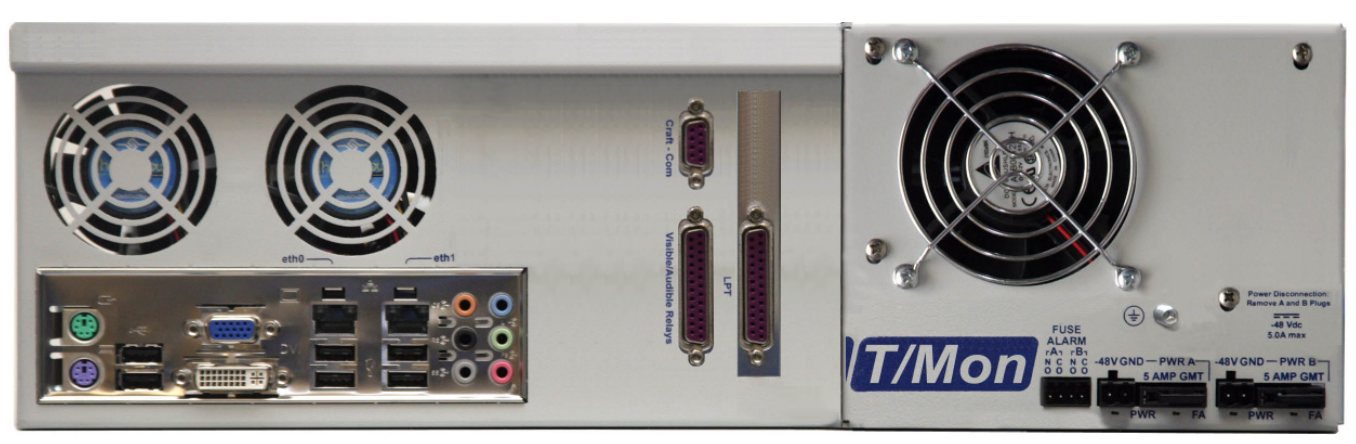
The T/Mon SLIM fits into any 19" or 23" rack without taking space from revenue generating equipment.