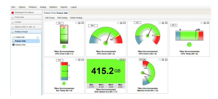
View and ack T/Mon SLIM alarms via Web browser

Since T/Mon SLIM can track multiple alarm inputs, it can also use those inputs to trigger Derived Controls — automatically operating equipment, doors, lights and pages to emergency response personnel.